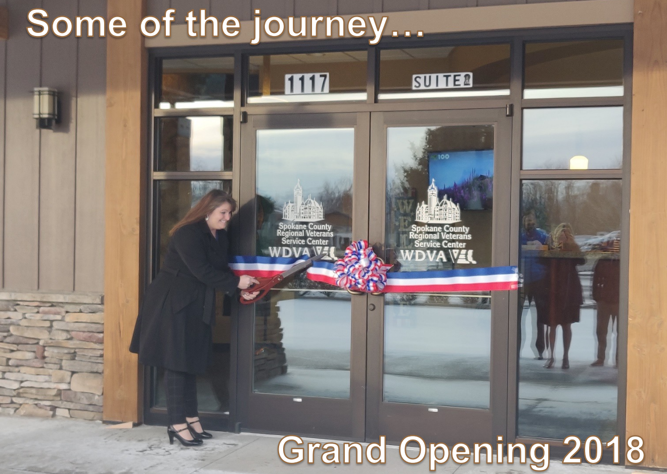
Grand Opening 2018