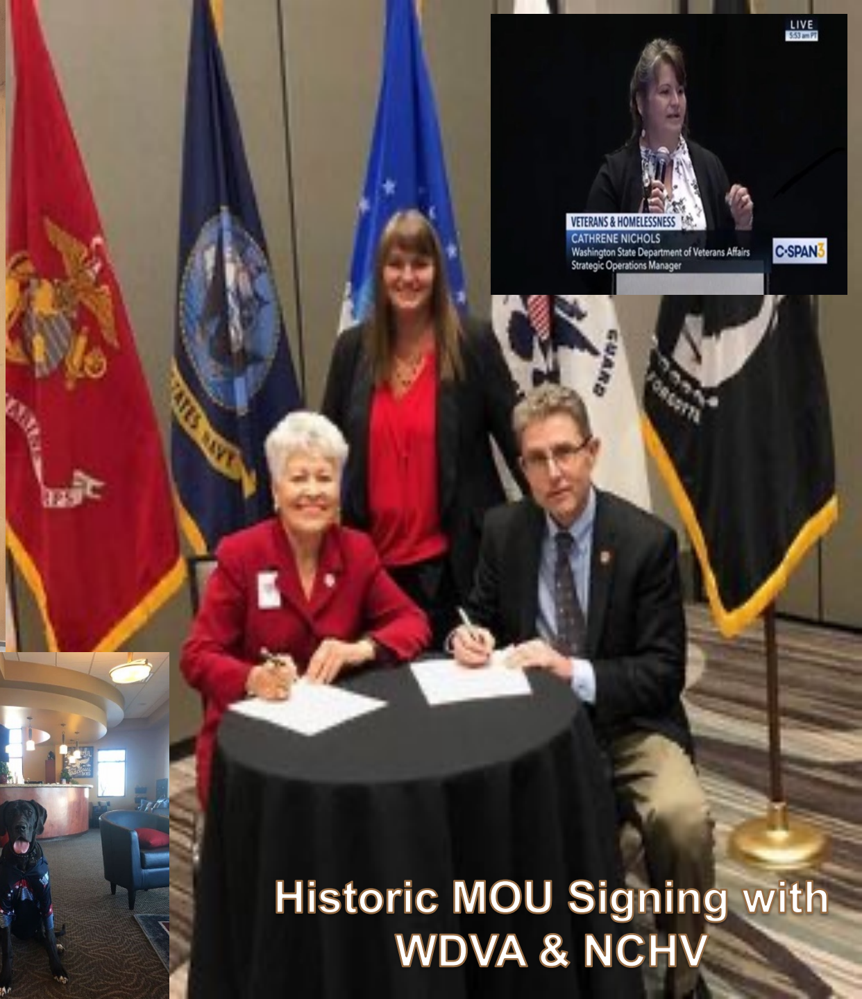
Historic MOU Signing with WDVA & NCHV