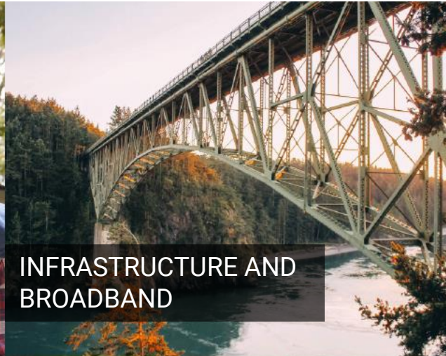
INFRASTRUCTURE AND BROADBAND