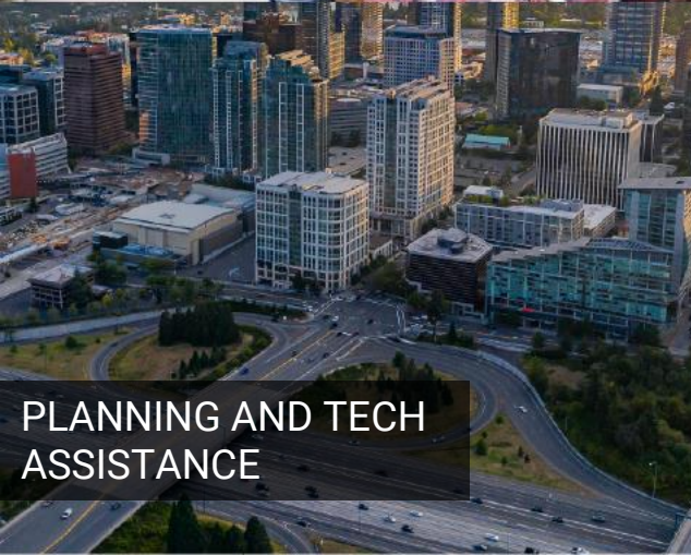
PLANNING AND TECH ASSISTANCE