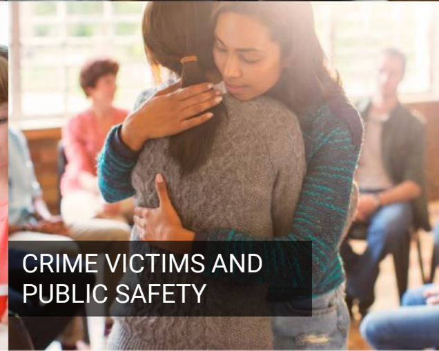
CRIME VICTIMS AND PUBLIC SAFETY