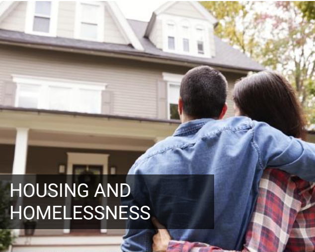
HOUSING AND HOMELESSNESS