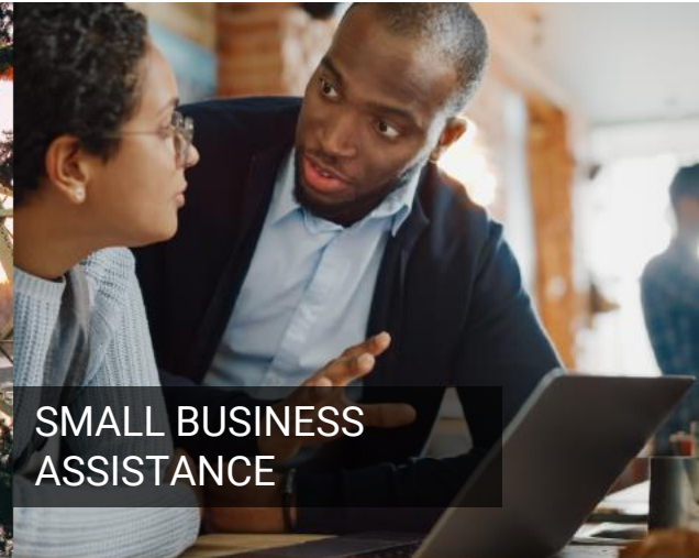
SMALL BUSINESS ASSISTANCE